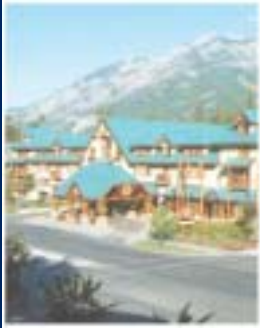
Banff Cariboo Lodge, Banff, Alberta

Ultimate Vacation's Canadian Rail and Villa Holiday uses quality standard hotel accommodation in Calgary, Banff, Lake Louise, Jasper, Kamloops, Vancouver and Victoria. Our hotels are selected for their location and character. The hotels listed are intended as a guide only. Ultimate Vacations reserves the right to substitute accommodation of the same standard without notice.